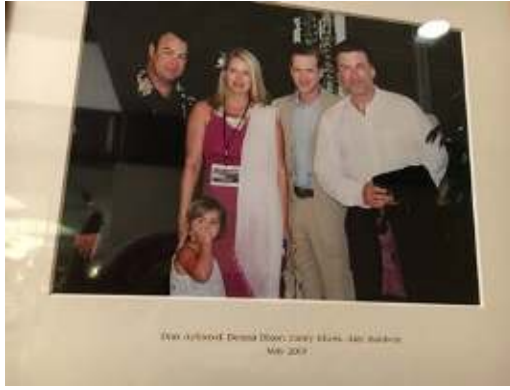
Dan Akroyd and Alec Baldwin at the Kahala