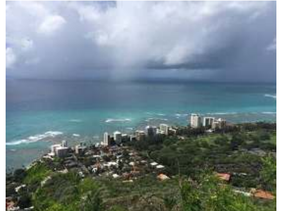
Spectacular View of O'ahu from Diamond Head