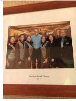
Barack Obama at the Kahala in 2015