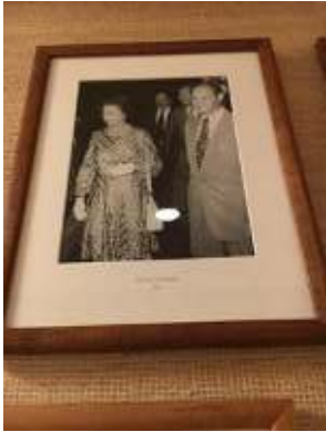
Queen Elizabeth at the Kahala